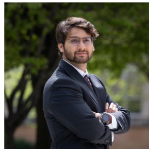
Professional Headshot